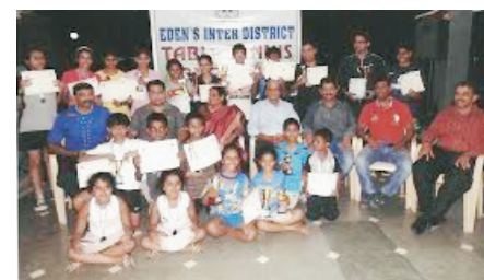
The results of the winners for the table tennis competition

The Managing Committee would like to thank all the staff of Eden Club for their whole hearted support in making this competition a success.